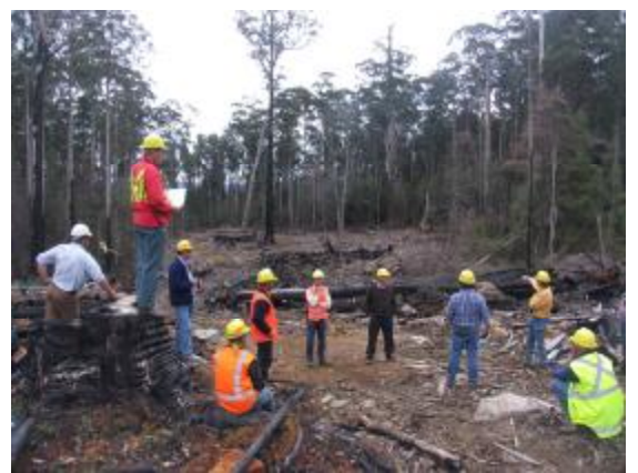
Design group and participants discuss the burn and access

It was noted by Steve Whiteley that group selection systems are potentially useful in areas that are rich in special species timbers, where some wood can be harvested now and where some wood can be held in areas set aside for future production. This will facilitate for example retention of leatherwood rich areas for honey production, or retention of areas of celery top pine for future craftwood or boat building, whilst enabling profitable harvesting at the first pass. The transition to group selection and aggregated retention systems in the broader operational landscape has commenced, particularly in STMUs and tall oldgrowth wet eucalypt forest respectively.