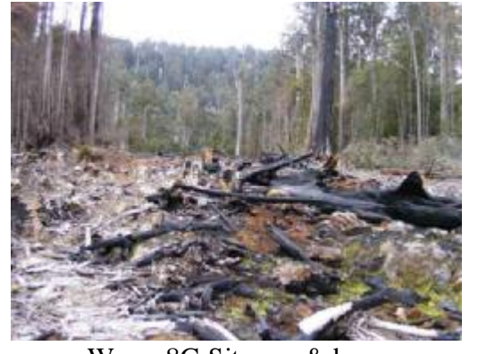
Warra 8G Site pre & burn