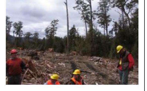
WR17B remaining slash and cull tree hazard

The group walked through the coupe to the unburnt "keyhole" remaining as an agreed trial following Marcus Tatton's earlier comments re burning. See Report 2. The group members present agreed that slash heaps that are in the centre of keyhole openings of 2 tree lengths, should be burnt, a confirmation of the thoughts expressed in Report 2.