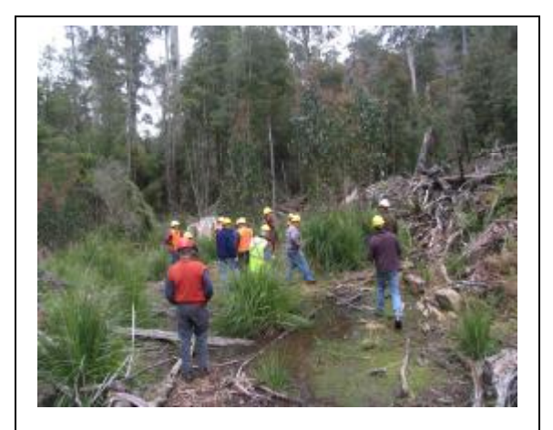
Warra 5D Lack of eucalypt regeneration and low height

comparison and makes a significant contribution to the knowledge base.